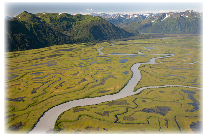
Copper River Delta aerial view