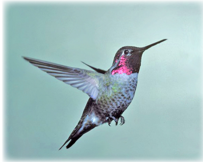
Anna's Hummingbird—male

APPEARANCE —Anna's Hummingbirds are mostly green and gray, without any rufous or orange marks on the body. The male's head and throat are covered in iridescent reddish-pink feathers that can look dull brown or gray without direct sunlight. Adult males (and some young males) have an iridescent rose/red crown and gorget with elongated feathers projecting to the sides. Males turn their head from side to side as they sing, flashing their iridescent head as a signal to other hummingbirds. They have a green back and are grayish below. Outer tail feathers are gray, darker at the edges. The tail extends well beyond the wingtips. Males are more vocal than any other North American hummingbird. The male has a dry, scratchy, buzzy "song" that it sings throughout the year.