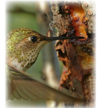
Feeding at sap well

They obtain tree sap from sap wells drilled in trees by