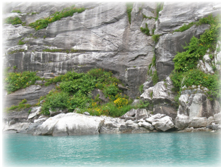
Isolated foraging opportunities

For hummingbird species to thrive, they need to find suitable habitat all along their migration routes, as well as in their breeding, nesting, and wintering areas.