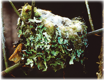
Rufous Hummingbird nest

Hummingbirds play an important role in the food web, pollinating a variety of flowering plants, some of which are specifically adapted to pollination by hummingbirds. Hummingbird numbers are declining, like those of other pollinators, due to habitat loss, changes in the distribution and abundance of nectar plants (which are affected by climate change), the spread of invasive