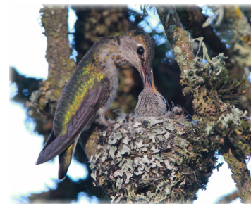
Anna's Hummingbird—female

COURTSHIP —The courtship display of the male Anna's Hummingbird lasts about 12 seconds, and includes diving from a height of over 100 feet which ends a unique short high-pitched noise made by air whipping through his tail feathers. As courtship progresses, the male chases a receptive female, who leads him toward her nest site, and perches again. The male then performs a "shuttle display," where he swings back and forth about a foot above the female, keeping his body horizontal and his head down toward the female, often singing an intense song.