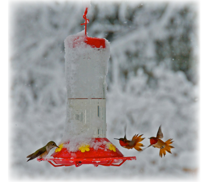
Early season Rufous Hummingbirds at feeder

The first hummingbirds typically arrive in Alaska by mid-April. Snow may still cover much of the ground that time of year and few flowers are available. Insects, such as mosquitoes and gnats, provide critical nutrients for these newly arrived hummingbirds as they establish territories and begin nesting. Hummingbirds feed by day on nectar from flowers, including annuals, perennials, trees, shrubs, and vines once they are available.