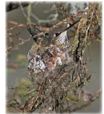
Rufous Hummingbird—female

NESTING —Female Rufous Hummingbirds construct nests alone using soft plant matter bonded with spiderwebs. She finishes the outside with flecks of lichens, mosses, and tree bark and cements it to the drooping branches of coniferous or deciduous trees up to 30 feet off the ground, and occasionally in shrubs, ferns, or vines. Nests have an outside diameter of 2 inches, the inner cup diameter is about an inch. Nests can be reused multiple seasons if in good condition, and may not be used by the same female. Females lay 2–3 white eggs and only raise one brood per season. Incubation lasts up to 17 days and nestlings are raised in as little as 19 days.