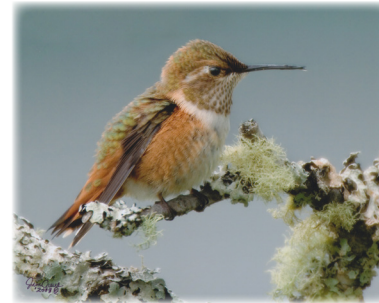
Rufous Hummingbird—female

HABITAT —Rufous Hummingbirds use a diversity of forested and wetland habitats from shoreline to alpine, as well as parks and residential areas. They commonly utilize hummingbird feeders when available. All ages and both sexes are aggressive in defense of territory and forage resources, including feeders. They are thought to be closely associated with the Red-breasted