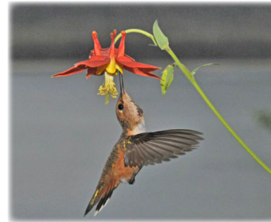
Western columbine— Aquilegia formosa

sapsuckers and other similar bird species. Native nectar plants and other foraging resource plants are listed in the table near the end of this guide.