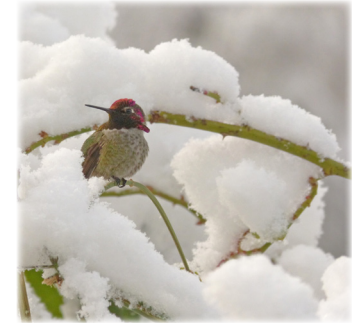
Anna's Hummingbird—male

Anna's Hummingbirds, however, are not known to nest in Alaska.