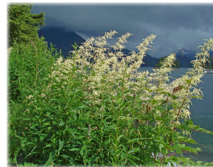
Goatsbeard— Aruncus dioicus

Forest Service representatives can also suggest potential plant collection locations. The use of locally-adapted genetically appropriate plants in restoration and pollinator enhancement work contributes to healthier gardens and a natural abundance of hummingbird forage resources. In addition, native plants can be maintained without the use of insecticides which can pose a serious threat to birds as well as the target insects. Some commercially available plants may look pretty but may not have flowers accessible to hummingbirds or other pollinators, they may not provide any nectar at all, or may be non-native plants. Please refer to the attached list for recommended plants to use in your area.