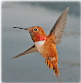
Rufous Hummingbird—male

APPEARANCE —The back of the adult male Rufous Hummingbird is cinnamon-colored (rufous), sometimes spangled with green and rarely more than half green. The underparts are creamy white with a rufous “vest.” The crown is bright green, and the gorget is iridescent scarlet to orange, appearing golden or yellow-green from some angles. The tail extends past the wingtips. The rufous tail feathers are black-tipped and pointed.