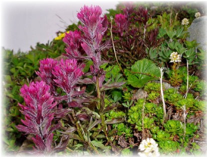
Mountain Indian paintbrush— Castilleja parviflora