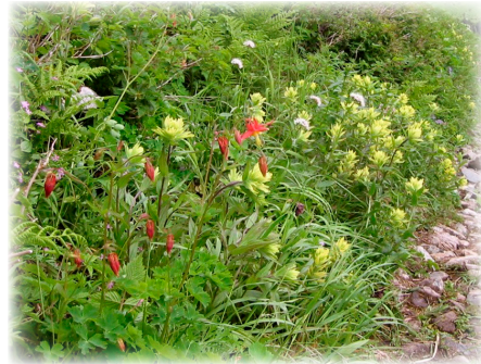
Unalaska paintbrush— Castilleja unalaschensis Western columbine— Aquilegia formosa