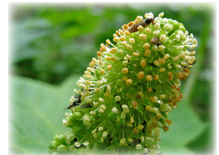
Devil's club— Oplopanax horridus