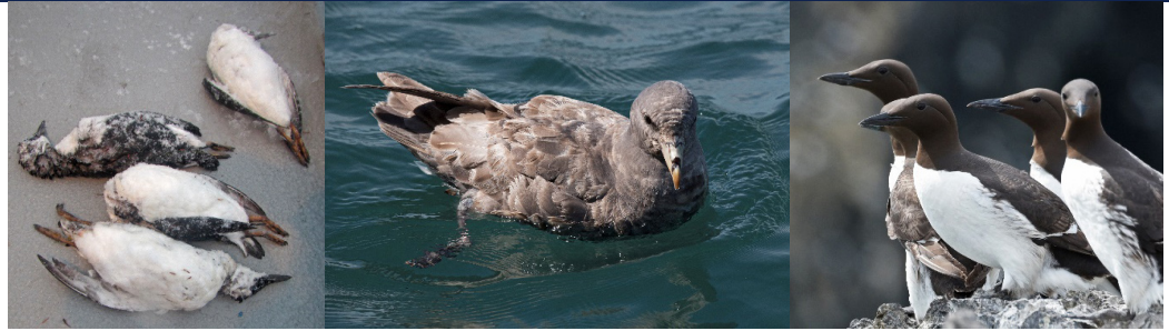
Photos: Common Murres, Northern Fulmar, Common Murres