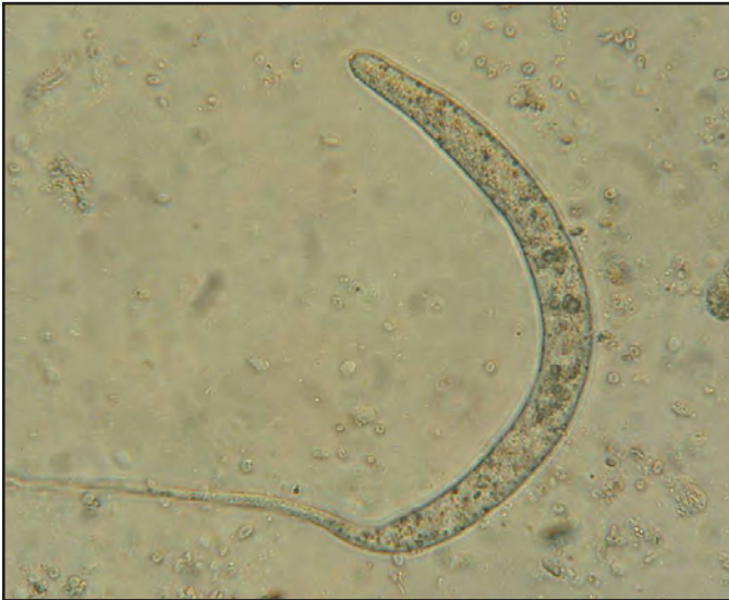
Juvenile Philonema nematode with posterior tail tapering into a fine point, X 400.