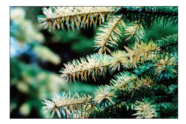
Figure 4. Only current-year needles of spruce are infected. Notice that the one-year old needles are not infected.

The following spring, another type of spore is produced on Labrador tea. This stage occurs at the same time spruce needles are emerging and elongating. Only these young, succulent needles are susceptible to the rust fungus. During summer months, the infected spruce needles yield the orange spores that can infect Labrador tea, beginning the cycle once again. Later in the season, infected needles are usually shed.