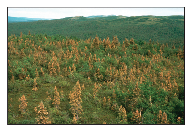
Figure 2. Some spruce stands may become heavily infected with spruce needle rust.

leathery, aromatic leaves with brown woolly hairs on the underside and commonly grows in poorly drained sites such as muskegs or bogs. When both hosts grow in or near these boggy areas, spruce needle rust can be severe.