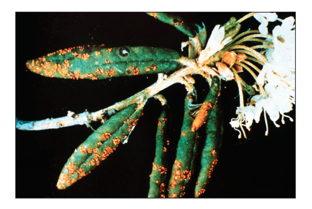
Figure 3. Labrador tea, the alternative host of spruce needle rust. Notice pustules of the rust fungus on the upper surface of leaves.

Once transmitted to Labrador tea, another orange mass of spores is produced on the upper surface of the leaves (Figure 3). This second type of spore infects neighboring Labrador tea, thus increasing the number of infected plants. The rust fungus overwinters in Labrador tea leaves.